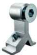
Mullion Connector 40mm