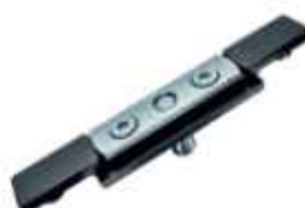
Centre Connector Diecast