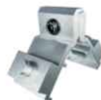
Corner Cleat 14x36