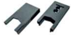
Inter Lock Cap 12mm