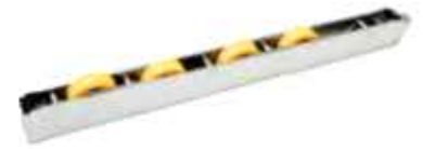
Four Adj. Roller