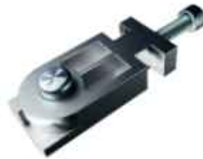
90° Corner Cleat 22mm