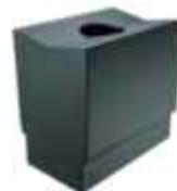
Lock Guide 24mm