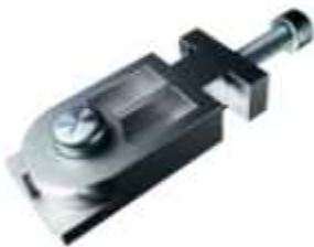
90° Corner Cleat 22mm