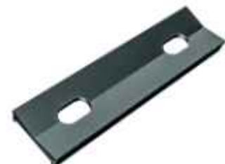
KEEP COVER FOR V-TRACK