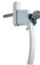
Casement Handle with Key