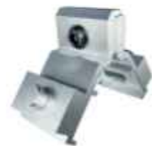
Corner Cleat 14x28