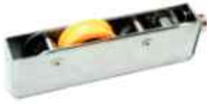
Single Adj. Roller