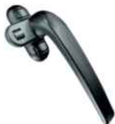
Single Point Handle