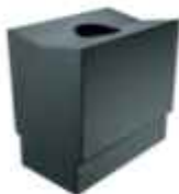
Lock Guide 27mm