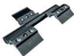
Butt Hinge For Door 40mm