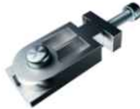
90° Corner Cleat 22mm