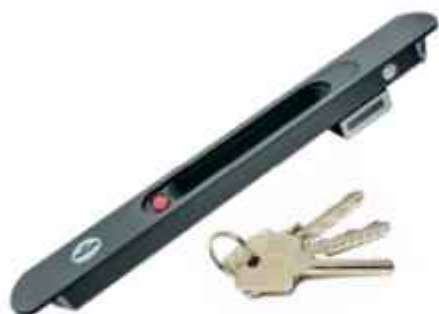
Concealed Lock With Key