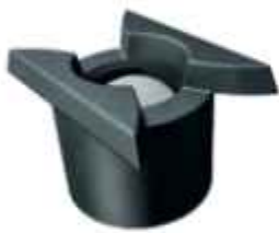
Non Return Valve