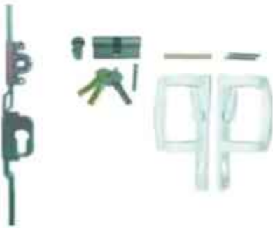
Sliding Doorset Lockable