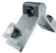
Corner Cleat 10x27