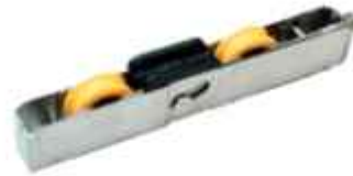
Double Adj. Roller