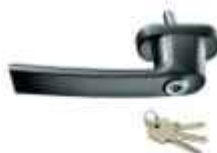
Sliding Handle With Key