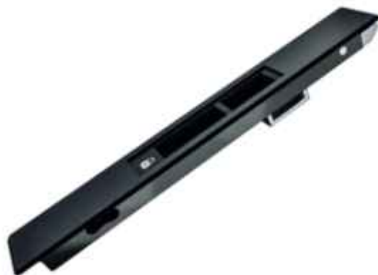
Concealed Lock Premium