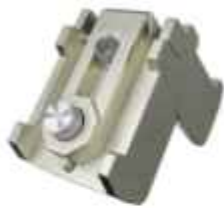
Corner Cleat Window Shutter 27x35