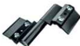
Butt Hinge 40mm