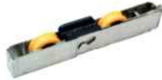
Double Adj. Roller