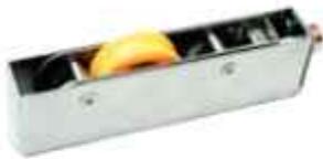
Single Adj. Roller