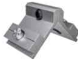
Corner Cleat 10x41