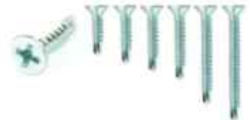
Self Drill Screw