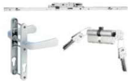
Casement Door Set