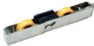
Double Adj. Roller