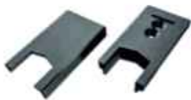
Inter Lock Cap 17mm