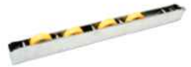
Four Adj. Roller