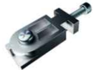
90° Corner Cleat 22mm