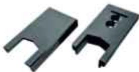
Inter Lock Cap 15mm