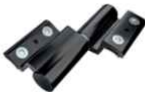
Heavy Door Butt Hinge 50mm