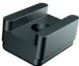
ESPAG GUIDE ADAPTER