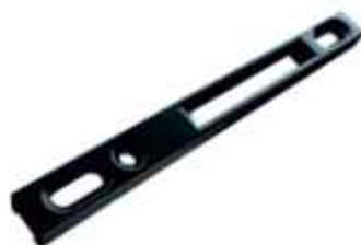
RECEIVER DIE CAST