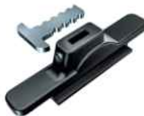
Nib Holder With Nib