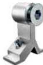
Mullion Connector 50mm