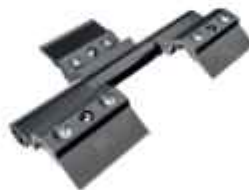
Door Butt Hinge 50mm