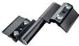
Butt Hinge 50mm