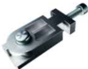
90° Corner Cleat 22mm