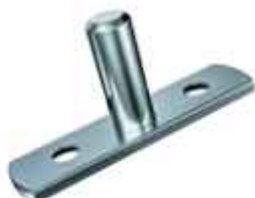
Centre Connector T-type