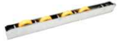
Four Adj. Roller