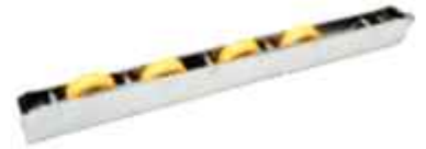
Four Adj. Roller