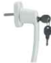
Sliding Handle with Key