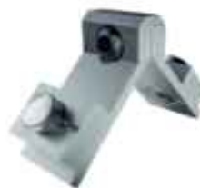
Corner Cleat 10x27