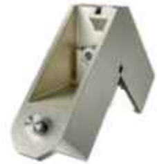
5010 Corner Cleat Door Shutter