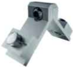
Corner Cleat 10x22