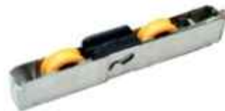
Double Adj. Roller