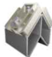
5011 Corner Cleat Door Frame