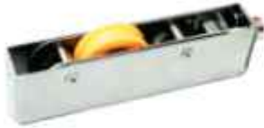
Single Adj. Roller