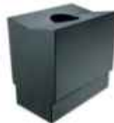
Lock Guide 24mm