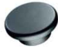
Screw Hole Cap