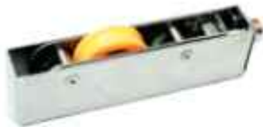
Single Adj. Roller