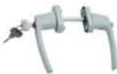
Both Side Handle