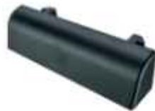
Drain Slot Cover