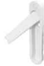
Pop Up Handle