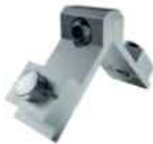
Corner Cleat 10x24