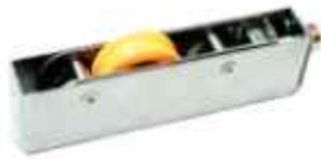
Single Adj. Roller