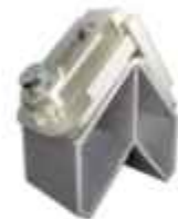
5012 Corner Cleat Door Shutter