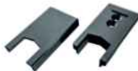
Inter Lock Cap 17mm